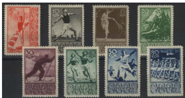
Russia #698-705 MH