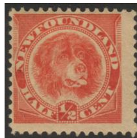
Newfoundland #57 MH