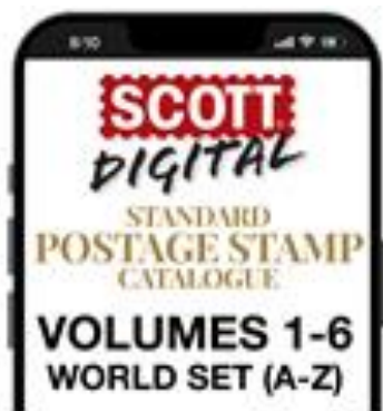
Scott Digital Catalog 1-year subscription