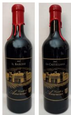
$100 Bottles of Napa Valley Wine