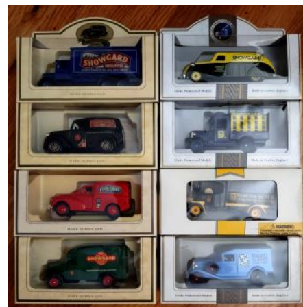
8 Vintage Model Trucks with Philatelic Themes