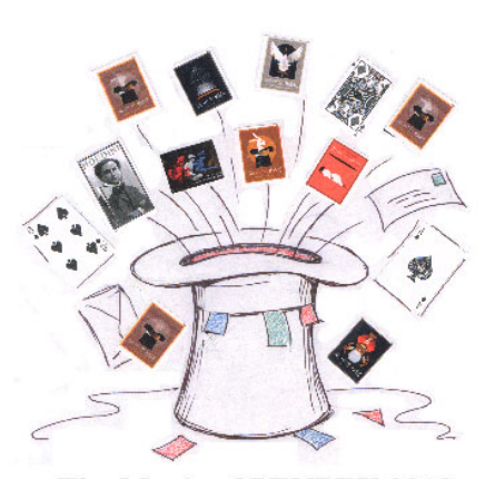
The Magic of PENPEX 2018

Thank you for attending PENPEX. We hope that the magic of stamp collecting has blessed your life.