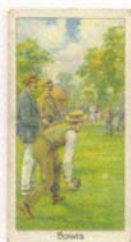
Tobacco card ca. 1910