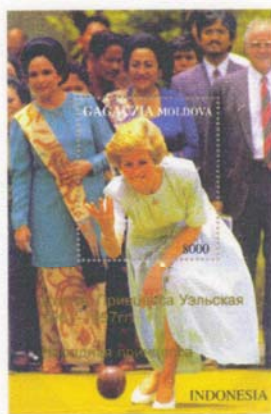
Princess Diana Bowling while touring Indonesia