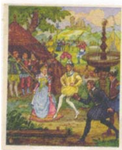
Trading card ca. 1300s

This display exhibit gives one a brief history and outline of basic knowledge needed for lawn bowling enthusiasts by using philatelic materials (preproduction materials, stamps, covers and cancellations), vintage photographs, tobacco cards, and trading cards.