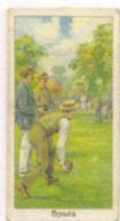
Tobacco card ca. 1910