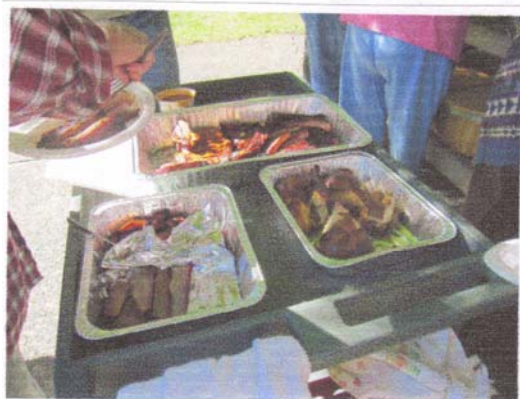
See the Arms diggin' into Armadillo Willies tasty BBQ ribs, steaks, chicken & sausage was served at the Picnic on Aug 12 and the side dishes of yummy salads and desserts provided by the Members.