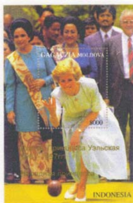
Princess Diana Bowling while touring Indonesia