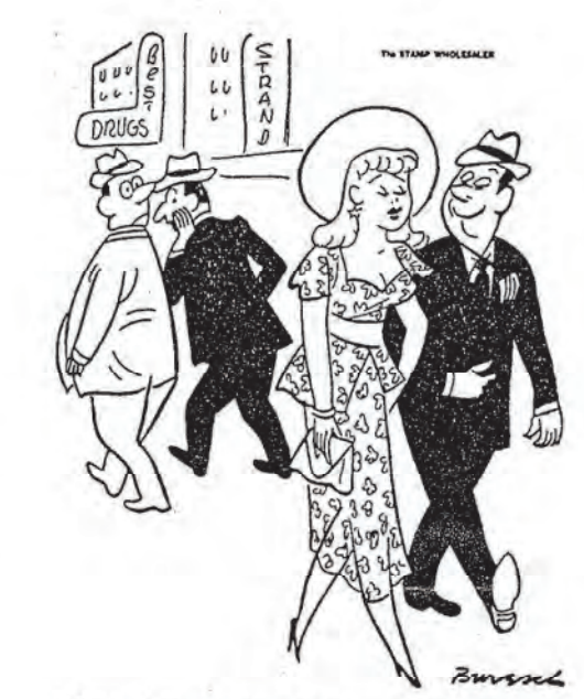
"One of these days he'll win her and have what he's been after - that collection of

PENPEX P. O. BOX 235 SAN CARLOS, CA 94070