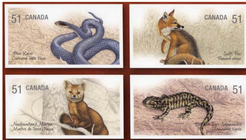
New Canadian Issue