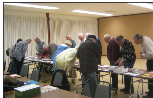
Did anyone see where that squished fly went?

What do you call a separated single from a block of four?