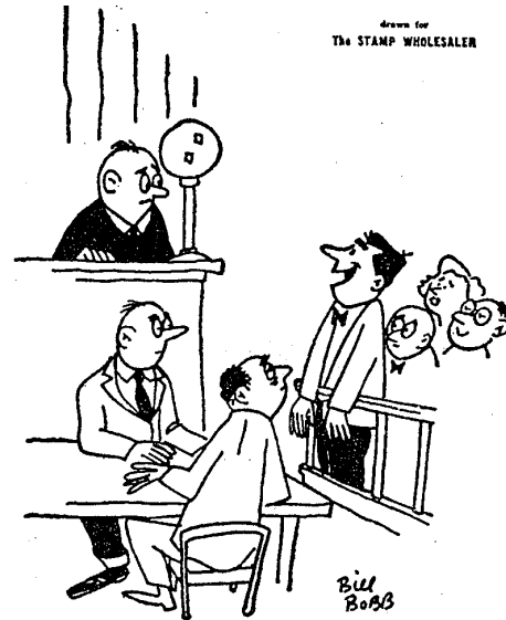
"Before we turn in the verdict, I'd like to know to whom the defendant is going to will his stamp collection!"

PENPEX P. O. BOX 235 SAN CARLOS, CA 94070