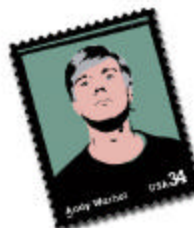
Andy Warhol stamp for 2002