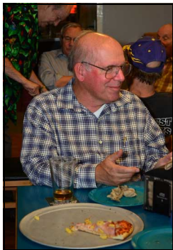
Good to the last piece