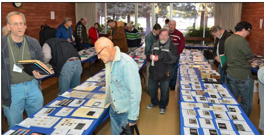
People viewing 540 silent auction lots before close on Sunday at 2:30.

As a thank you, PENPEX is inviting all show volunteers to a 10 am January 25 th , wrap-up meeting followed by brunch at Sizzler, 1011