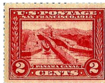
1913 2¢ Panama-Pacific Exposition Commemorative

Issue Date: January 1913 Quantity issued: 503,713,086 Printed by: Bureau of Engraving and Printing Method: Flat plate Watermark: Single line Perforation: 12 Color: Carmine