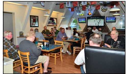
Beer, pizza, hockey, baseball, stamp collectors...all in one place

On Tuesday, Oct. 15 at Mountain Mike's in Redwood City, the Sequoia Stamp Club members were treated to an annual pizza blast. As the photo shows, there was a good turnout and a pleasant evening was enjoyed by all who attended. No one left hungry as it was all you could eat of Mountain Mike's tasty pizzas and since Tuesday is half-price night, it was a fun club activity that was well worth the cost.