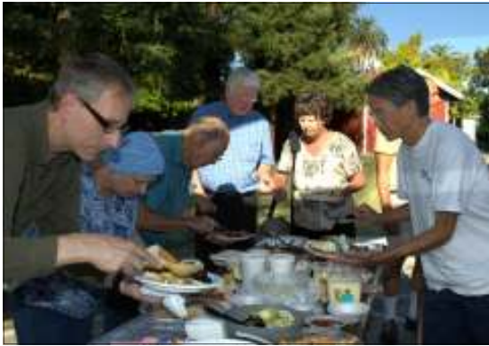
Digging in at the food table.

Sequoia Stamp Club held its annual summer picnic on August 19 at Red Morton Park in Redwood City. As usual, the salads and desserts brought by members to share were delicious, and the main course of chicken, ribs, brisket, pulled pork, and beans supplied by Armadillo Willy's was better than ever. A good turnout of 38 people enjoyed the food and socializing on a typically warm evening in Redwood City, which as we know has "climate best by government test". Don't forget to mark your calendar for our next social event which will be the Pizza Party at 5:00pm at Mountain Mike's at 120 El Camino Real in Redwood City on Nov. 11. The Pizza Party will be held in place of our regular meeting which has been canceled due the Community Building being closed for Veteran's Day.