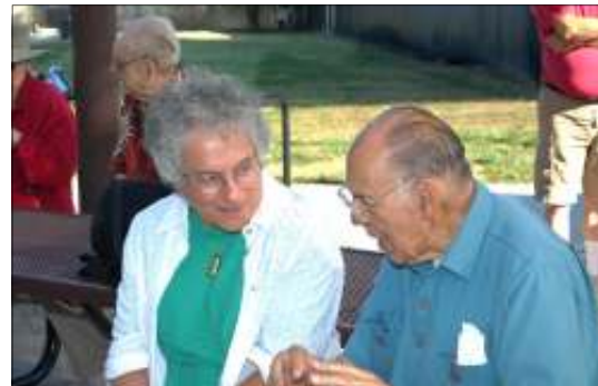
I hope they're not talking about Preston!