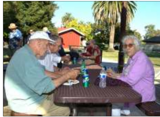
Beautiful day for a picnic.