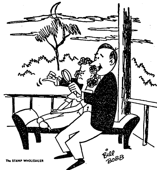
"The red in this issue sorta reminds me of the henna in your hair!"

Visit Us At www.penpex.org ed@biermans.com