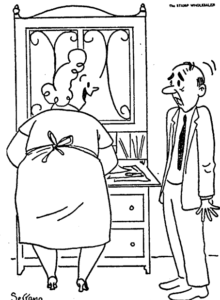
Scifano "Oh, those old stamps! I threw them out - they were used already!"