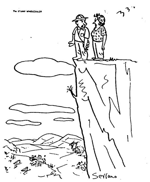
"What kind of a vacation spot is this? There isn't a stamp collector in sight!"

PENPEX P. O. BOX 235 SAN CARLOS, CA 94070