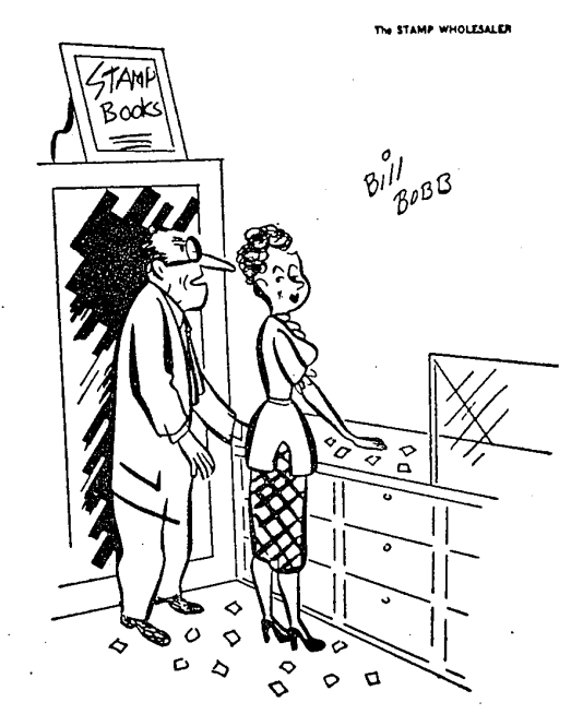
"Miss Deutsch, people that buy stamps are called customers, not suckers!"