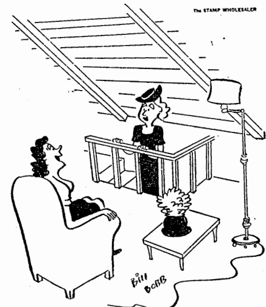
"We've been living up here since Hap's stamp collection has gotten so big!"

PENPEX P. O. BOX 235 SAN CARLOS, CA 94070