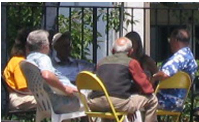
Enjoying the beautiful weather.