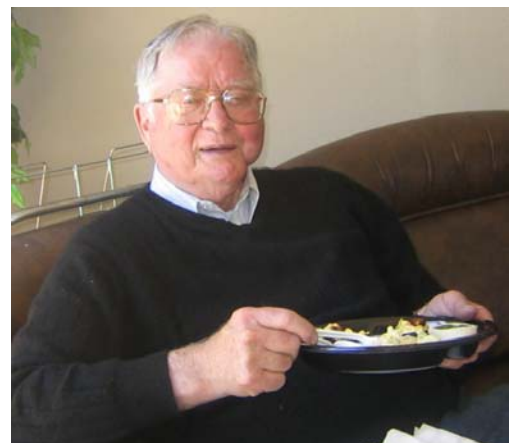
Hank says, "Go away I'm eating."