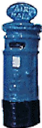
1930-38 Blue Airmail Box.