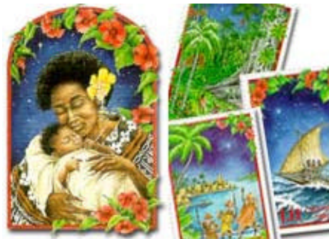
2000 Fiji Christmas Issue