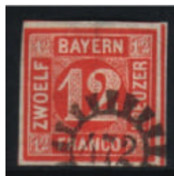
Germany-Bavaria 1858 12kr red