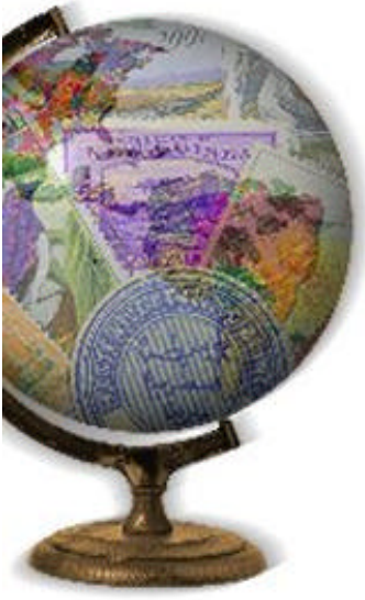
Philatelic Atlas is an excellent tool for research.