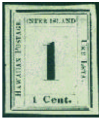
Interesting Hawaiian Stamp Web site -- http://www.aloha.net/~rodne/